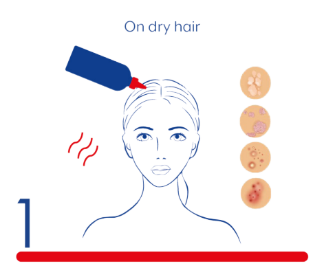
Apply THERARX™ onto the areas of concern. Massage gently into the scalp.