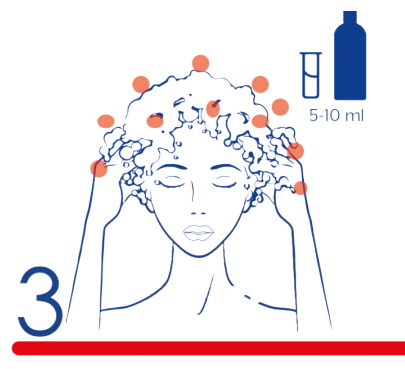
Shampoo with X-FOLATE™ plus. Leave on for 2-3 minutes.