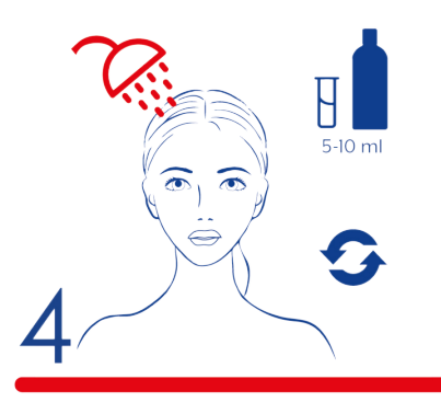
Rinse hair thoroughly. If necessary do a second shampoo.