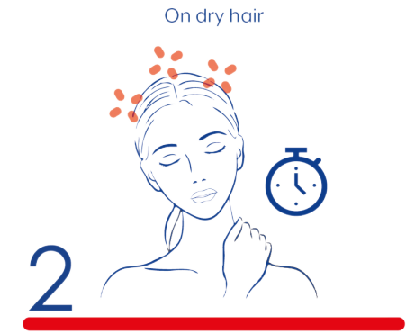
Allow it to act for 1-2 minutes to neutralize unwanted symptoms. Do not rinse.