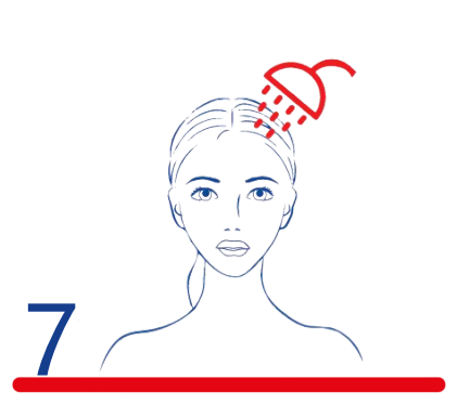
Rinse hair thoroughly.